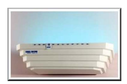
Made in Australia