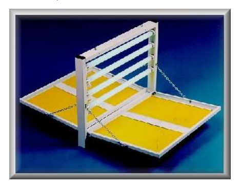
Made in Australia

66 x 52 x 52cm one panel horizontal 66 x 95 x 52cm two panel horizontal