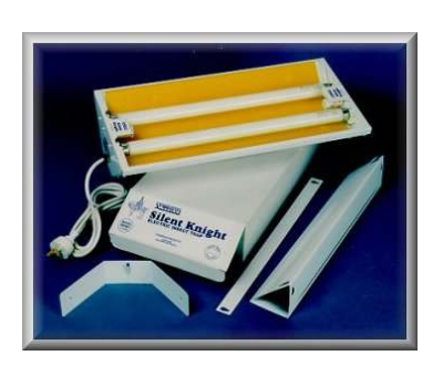
Made in Australia