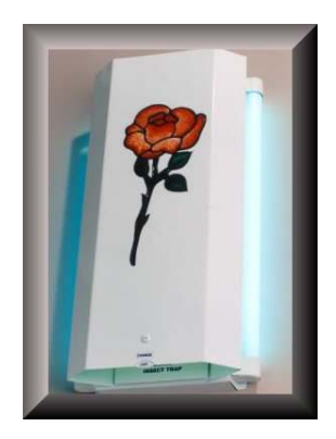
Made in Australia

180 degree visibility - attractive to flying insect pests. Easy replacement of sticky pads 2 x 15W U Straight Blacklight Tubes H 50cm W 25cm D 12.5cm