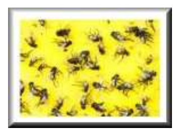
Made in Australia